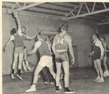
Ministers play basketball

"But there rose up certain of the sect of the Pharisees which believed, saying, That it was needful to circumcise them, and to command them to